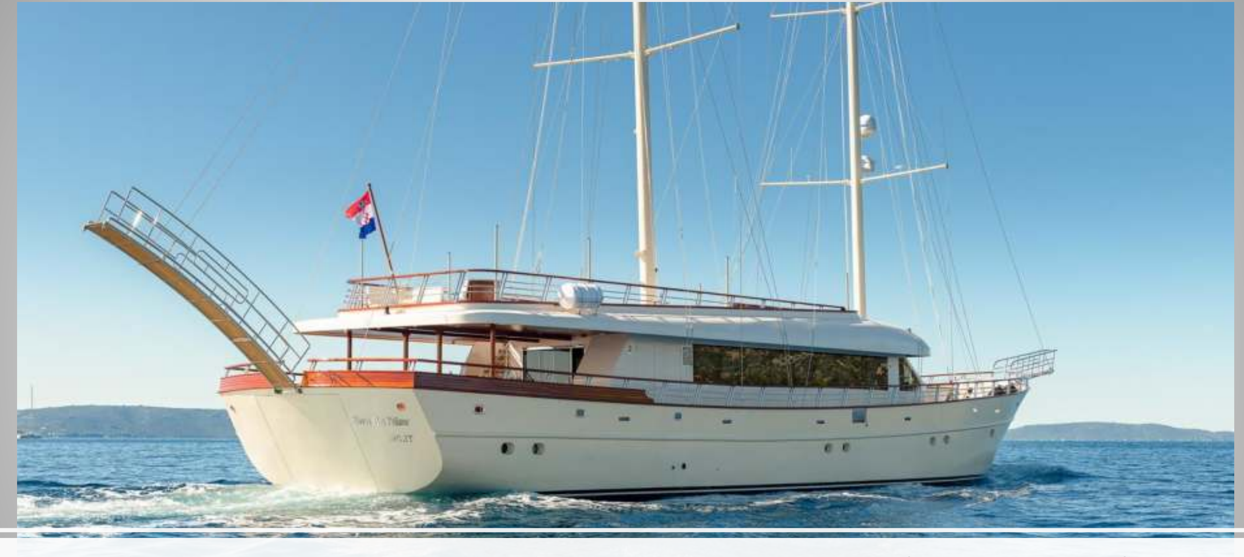
Built 2019 ● LOA 45 m ● 12 guests in 6 cabins ● 7 crew ● Beam 8,36 m ● Draft 2,40 m ● Croatian flag Speed kn: cruising 9 / max 12