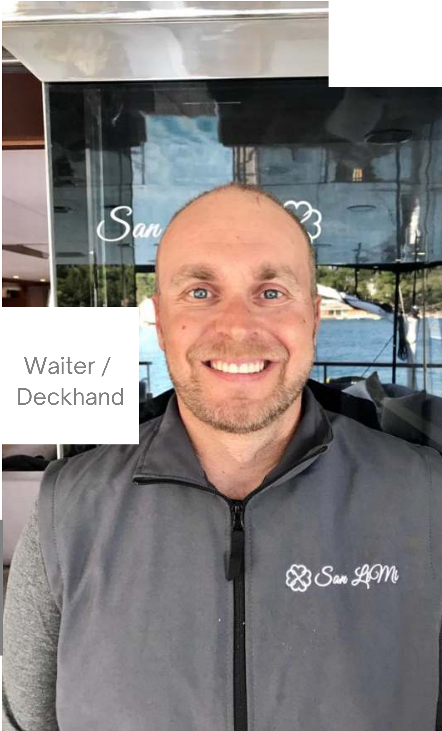
Waiter / Deckhand